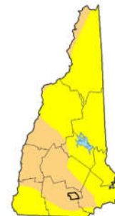
U.S. Drought Monitor New Hampshire

May 4, 2021 (Released Thursday, May 4, 2021) Valid 8 a.m. EDT